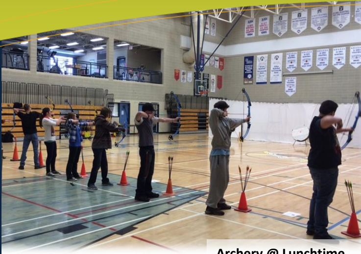
Archery @ Lunchtime